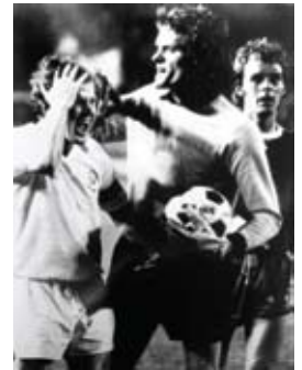
Below: Disbelief for Billy Bremner after the goal is disallowed and the scoreboard showing what the history books should be.