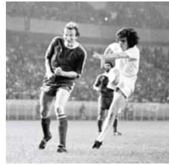
Left: Franz Beckenbauer clearly fouling Allan Clarke for what should have been a penalty.

In a nutshell? We are the Champions! Champions of Europe!