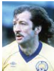
Aidan Butterworth and (left) Frank Worthington